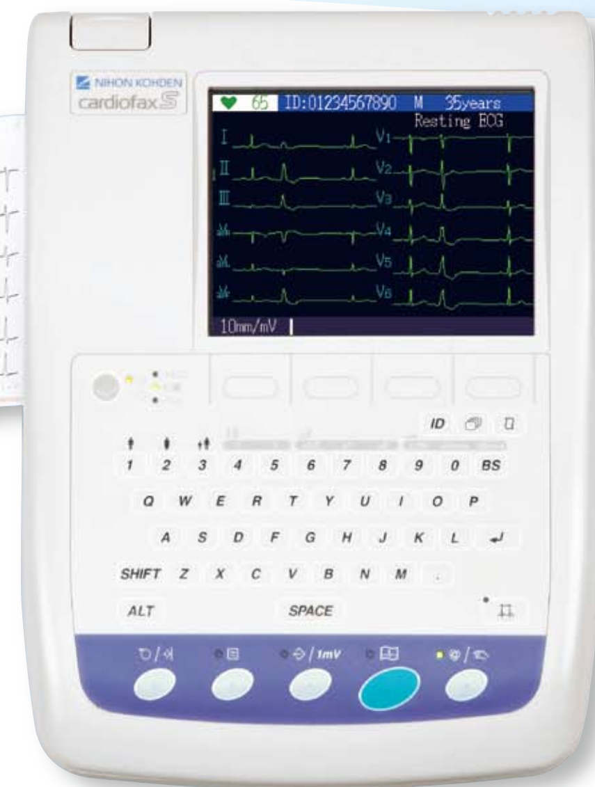
cardiofax S * S = sophia