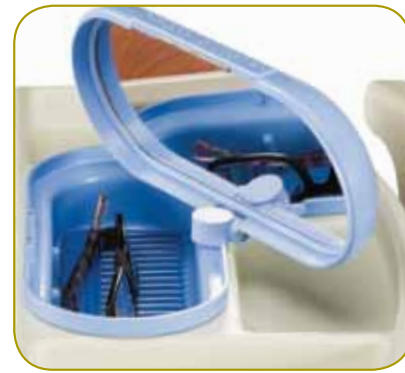
Mirror/storage module Cleans easily and is made of break-resistant acrylic. Also, is attached atop the table for easy access to storage.