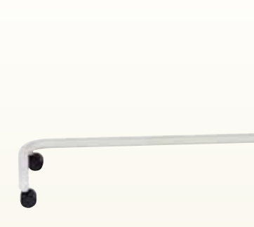
Easy roll casters Allows the table to be moved effortlessly.