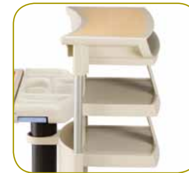
Fixed caregiver surface option Remains stationary while table is raised and lowered. Features two bins and laptop storage.