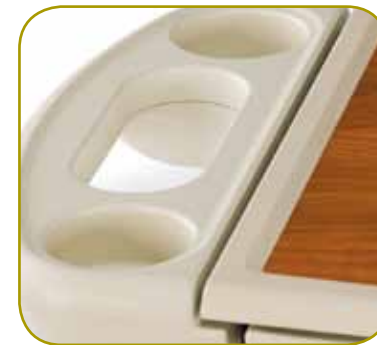
Cup holders Reduces spillage and cleans easily.