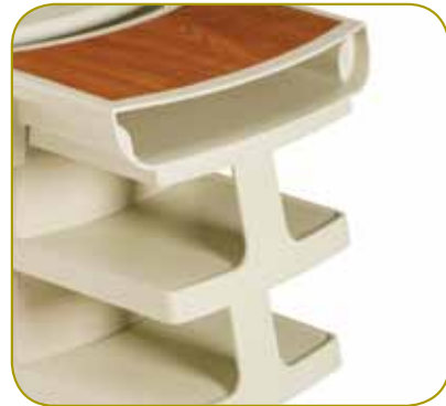
Fixed caregiver module Remains stationary while table is raised and lowered. Features two bins and laptop storage.