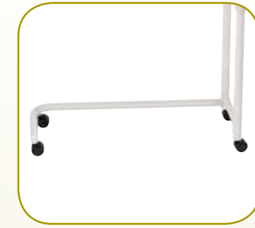
"C" Base Fits easily under beds even with power transport.