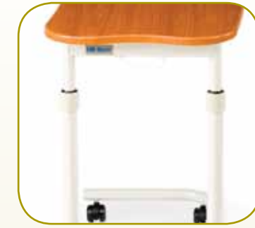
Dual column Raises and lowers the table quietly.