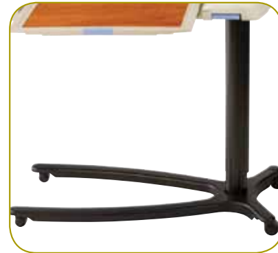
Tuning fork base Fits easily under beds, even with power transport.