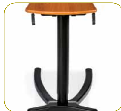
Steel column Raises and lowers table quietly with minimal effort.