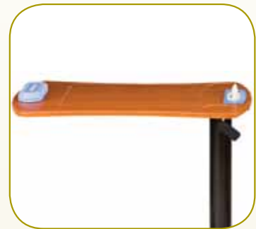
Large surface area Allows patients to create a home away from home, with easy access to belongings.