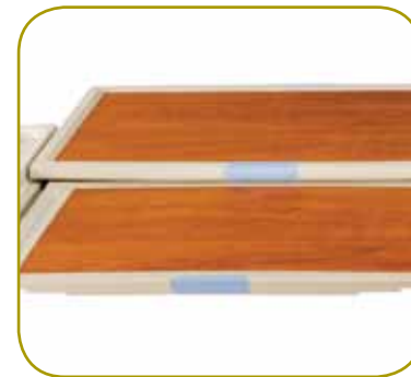
Dual food service tray Provides 30 percent more surface area, so patients don't need to move belongings at meals.