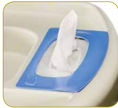
Purell. Personal Pack Wipes hand hygiene dispenser Helps control infection and aids patient safety with convenient bedside hand sanitizing.