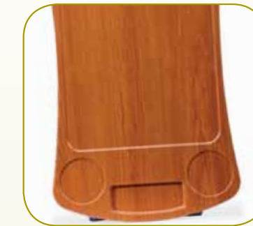
Three top options Features seamless thermofoil technology which cleans easily.