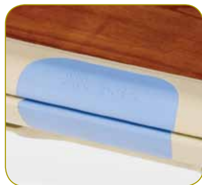
Braille on all touch points Convenient descriptions for patients, guests or caregivers.