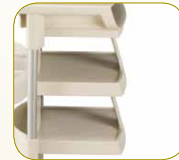
Fixed caregiver surface option Remains stationary while table is raised and lowered. Features two bins and laptop storage.